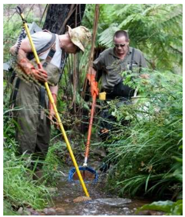
Figure 4. Electrofishing for galaxiids.

Researchers can then estimate habitat suitability for a species across the landscape. Updates to Habitat Distribution Models will improve understanding of the habitat suitability of the landscape for threatened forest-dependent species and predict the likelihood of suitable habitat in areas that have not been surveyed.