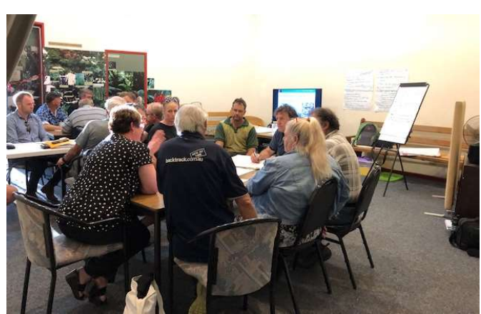
Figure 1: A recent workshop in Orbost.

Community response has been strong. People are telling us that they appreciate the opportunity to be heard. And there are still many more events to come!