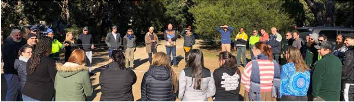
DELWP Aboriginal Staff Conference 2019 'Languages, Treaty, Truth'