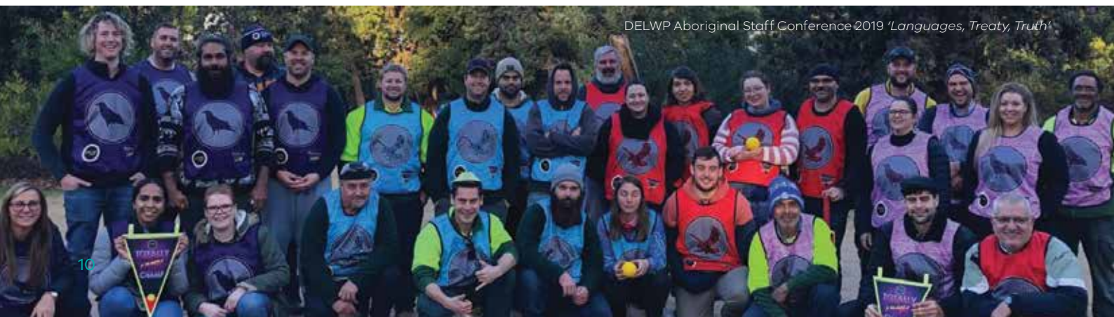
DELWP Aboriginal Staff Conference 2019 'Languages, Treaty, Truth'

There are various approaches that are being taken across DELWP to support culturally-safe workplaces. However, some locations are doing better than others. Through the active implementation of this Framework, we will build upon and strengthen the foundations already in place.