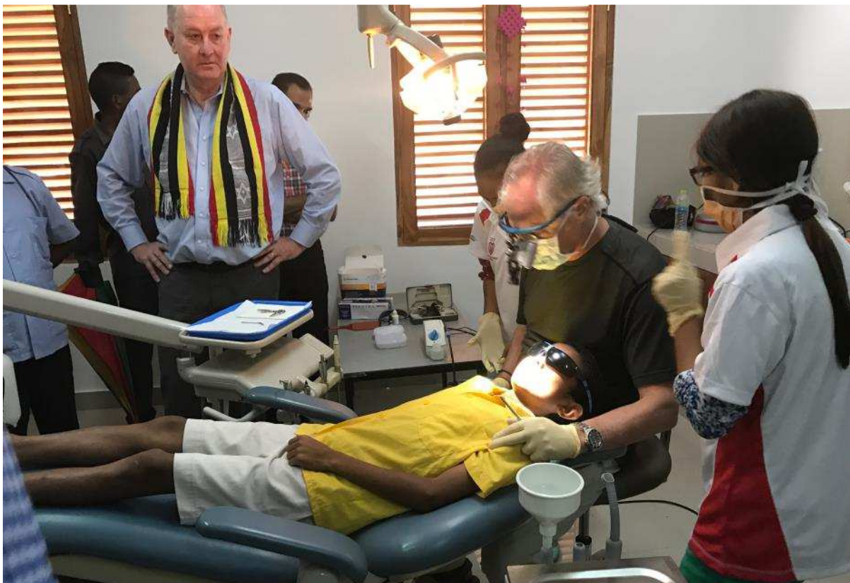
With volunteer dentists, staff and clients at the recently opened dental clinic