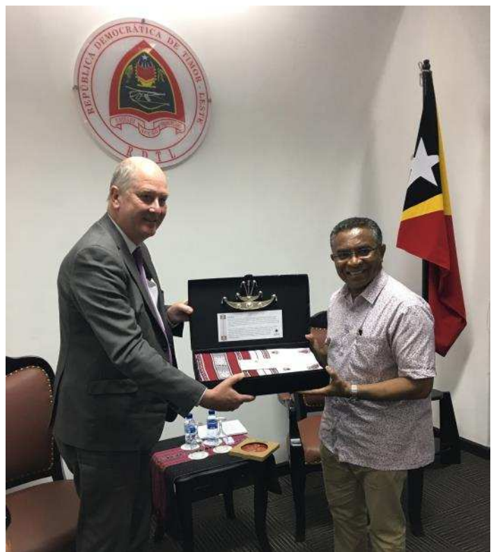
Minister Wynne with Prime Minister H.E. Dr Rui Maria de Araújo

There was discussion around renewing the Memorandum of Understanding (MOU) between the Victorian and Timor-Leste Governments, with an updated MOU well progressed. As there are parliamentary elections in Timor-Leste in July this year, it's planned the signing will be done under its new Government. The Prime Minister noted the MOU will marry with Timor-Leste's Strategic Development Plan, which sets out priorities for the next 30 years.