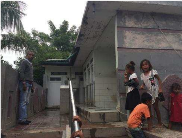
Communal water and sanitation facilities