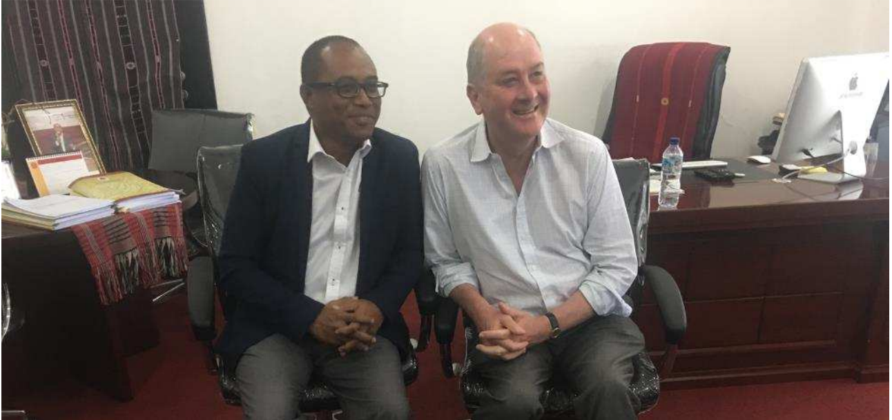
With His Excellency H.E. Dionísio Babo Soares

parcels of land, estimated as one third of the total across the country. These parcels have been registered, also enabling registration of changes of ownership.