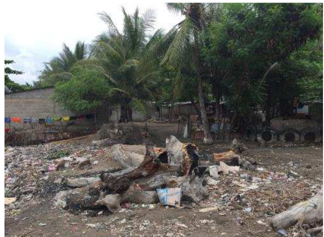
Waste and pollution issues at Tasi Tolu