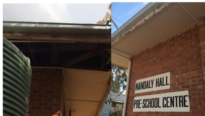
How it looks before and after

The Nandaly Public Hall Committee of Management Incorporated, recently received $8,000 from DELWP's Public Safety on Public Land funding program to remove asbestos and repair the eaves on the hall.