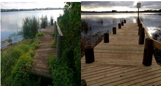
Before and after pictures

The committee accessed the Community Assistance fund in 2013 and built a picnic table and seating close to the jetty enhancing the lake as a passive recreation spot.