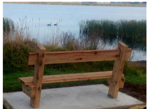
Enjoy the tranquillity of Lake Cartcarrong

The small committee has not faltered in the aim of bringing about long term sustainable change by improving the biodiversity of Lake Cartcarrong and developing lake facilities to create a unique and valued community asset.