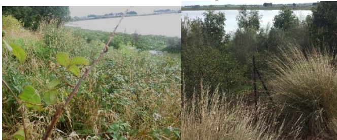
Before and after weeds in one of the targeted areas

The committee and involved community members spent hours, clearing, weeding, spraying and mulching prior to planting. These areas also required fencing to protect the small plants due to an increasing number of rabbits and local wallabies returning.