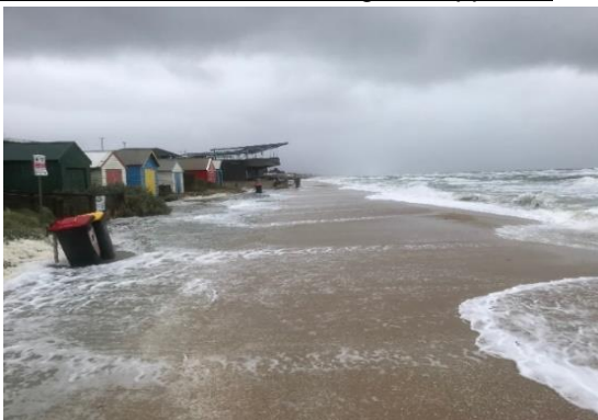
Stormy weather on the Bay

For more information, please see the project web page http://www.marineandcoasts.vic.gov.au/ppbcha