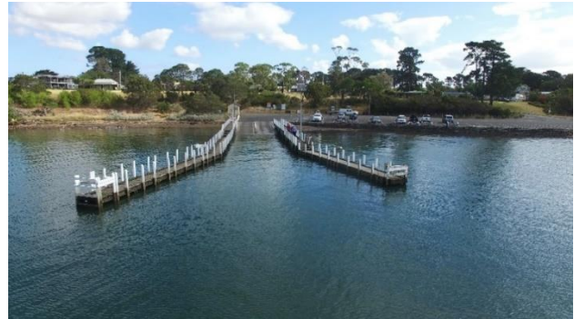
Corinella Foreshore Reserve