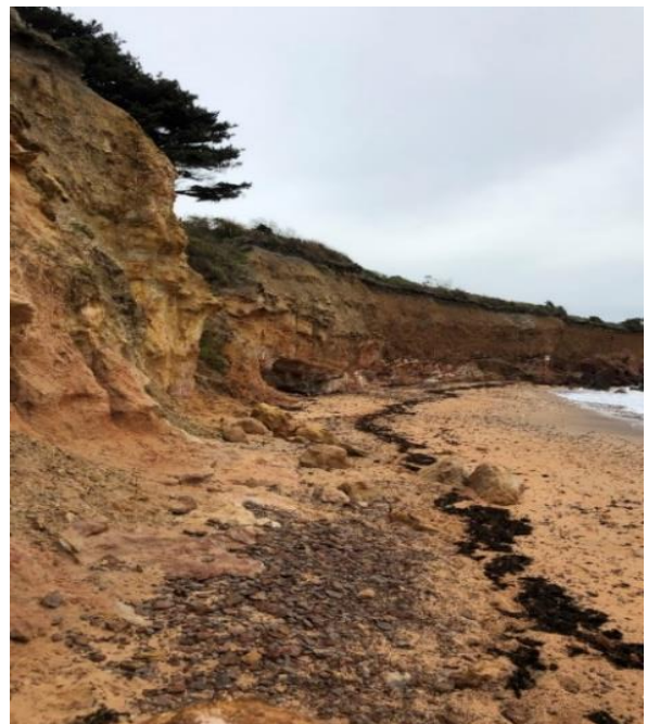
Example of erosion at work