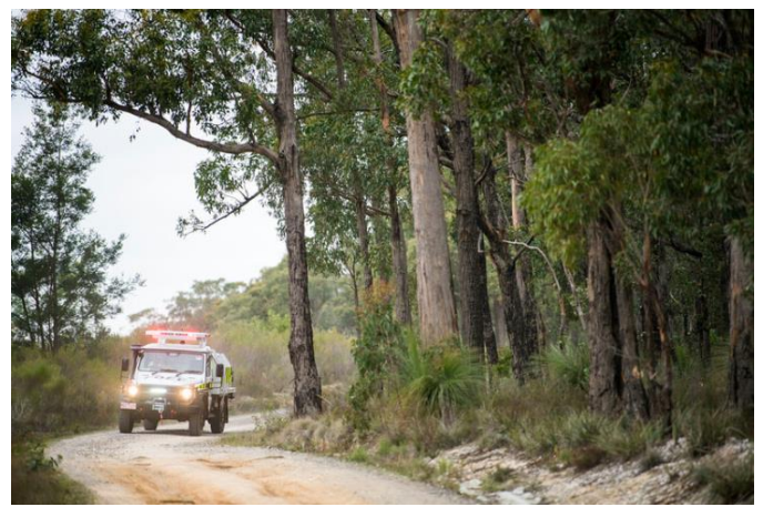
Climate change is likely to lead to harsher fire weather and longer fire seasons.

In addition, forests are an important part of the global carbon cycle, therefore monitoring carbon stocks in forests is an essential part of sustainable forest management (see Fact Sheet 8: Carbon). Carbon sequestration is expected to decrease due to climate change and the associated increase in fire hazards.