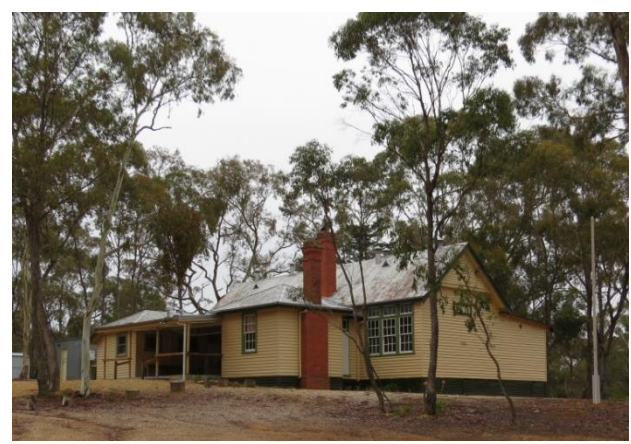
Fryerstown Community Reserve