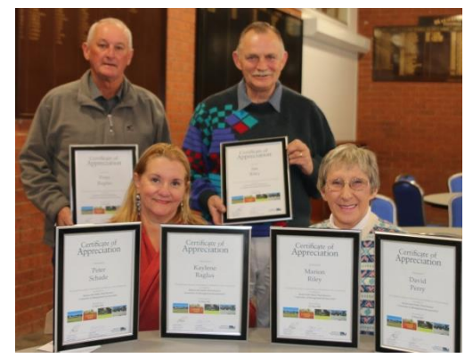
Rushworth Public Park Reserve Committee of Managemen

DELWP Loddon Mallee celebrated National Volunteer Week by awarding certificates of appreciation to 38 volunteers.