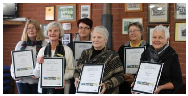
Echuca Historical Society Incorporated

The awards recognise the volunteers' efforts and achievements in managing and caring for much-loved reserves and community facilities.