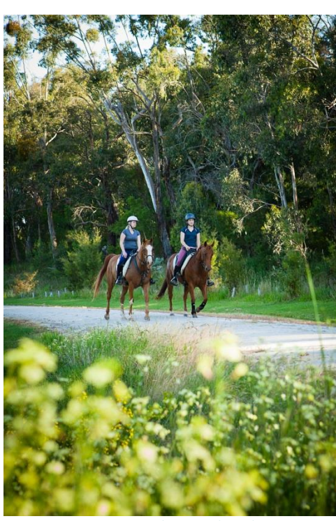
Great Southern Rail Trail

In partnership with DELWP, the Great Southern Rail Trail CoM recently organised an extensive audit of potentially hazardous trees along the trail.