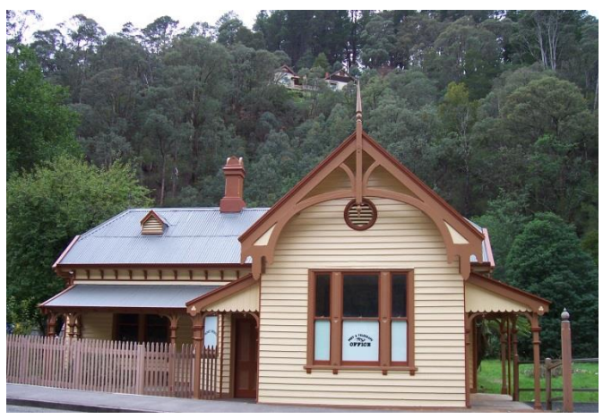
Walhalla Post Office

These include the following tourist draw-cards; the Walhalla Long Tunnel Extended Mine, the Chinese Gardens, the heritage listed buildings of the Walhalla Post Office, and the Mechanics Institute.