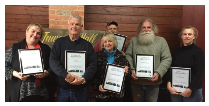
Fawcett Mechanics Institute Reserve Committee of Management

Fawcett Hall was founded in 1882 by local residents wanting to provide a library for the education and enjoyment of the local community.