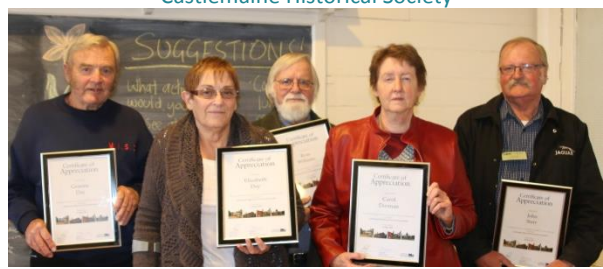
Castlemaine Historical Society Incorporated

Committee of Management volunteers are the unsung custodians of our great outdoors, lending their hands to help manage Victoria's public land estate."